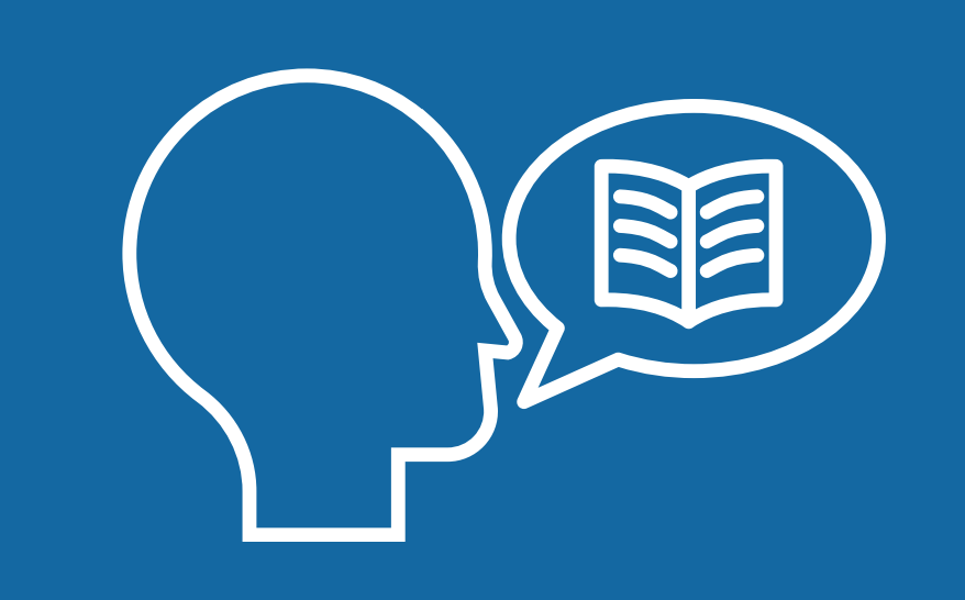
Healing & Humanization via Storytelling